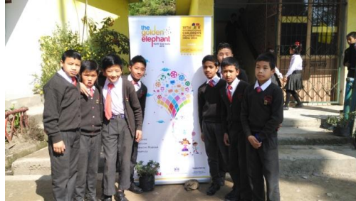
ICFFI - Sikkim

After successful completion of 19th ICFFI in Hyderabad from 14th to 20th November, 2015 CFSI conducted a similar International Children’s Film Festival in north east in collaboration with Cultural Affairs & Heritage Department, Sikkim at 6 places Dodak, Angden, Daramdin village, Rinchenpong, Sombaria and Kaluk of West Sikkim with the opening ceremony in Gangtok from 14.03.2016 to 16.03.2016.