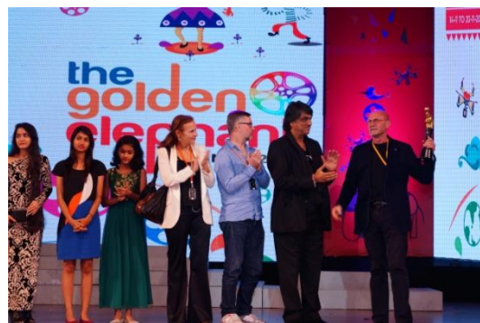
ICFFI - Awards