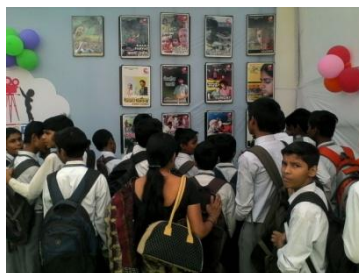
Bihar - Ek Virasat - Journey of CFSI