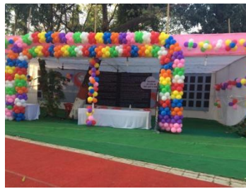
Bihar - Ek Virasat - Journey of CFSI

Children's Film Society India in collaboration with Asian Center for Entertainment Education-the Third Eye (ACEE) had organized Children's Film Festival in Patna and tied up with the Kasturba Gandhi Balika Vidyalaya (KGBV) at Durgawati and Kilkari Bihar Bal Bhavan to co-organize a film festival from 17th March to 20th March, 2016.