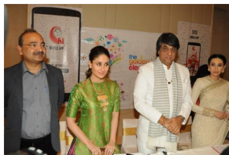
ICFFI - Mobile app launch