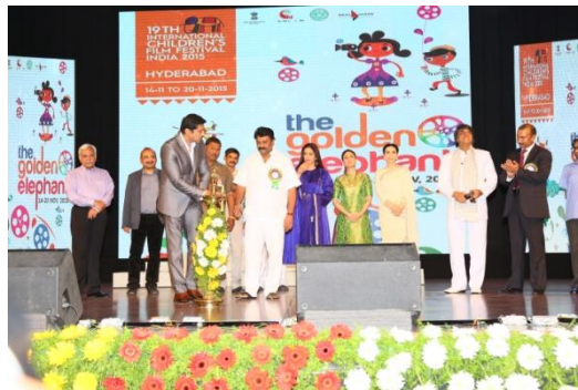
ICFFI – Opening Ceremony