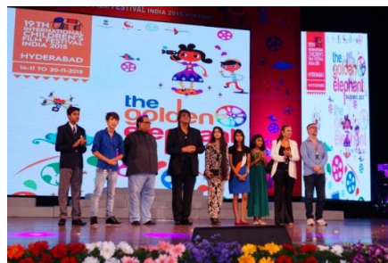
ICFFI - Closing Ceremony