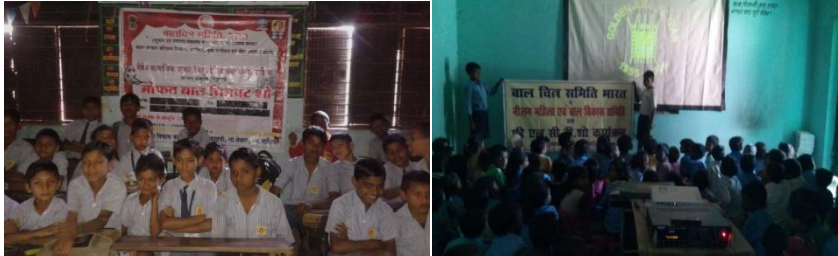
Nashik – Bhojpur LCD shows

Nehru Yuva Kendra, Non-Governmental Organizations & District Administration of respective states are availed for this activity. The expenditure involved in conducting the FREE shows is borne by CFSI out of grant in aid provided by the Government for this purpose. Under this scheme, not only school students but also children living in remand homes, orphanages etc. are given the benefit of watching children's films, who otherwise are deprived of any other form of entertainment. 1,011 shows were held & 2,55,657 child audience were covered. The details are as follows in annexure – D.